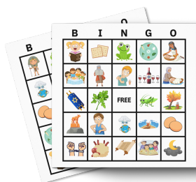
Passover Picture BINGO