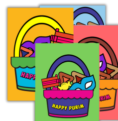
Purim Basket Craft