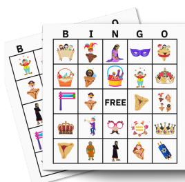
Purim Picture BINGO